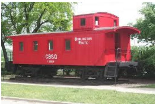
Railroad Park, Historic Valley Junction